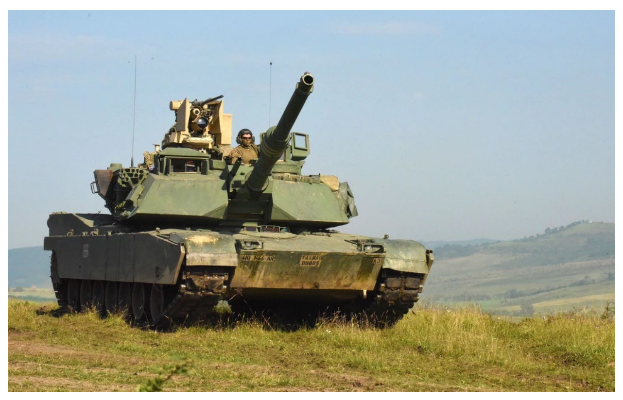
Figure 2. U.S. Army Soldiers of 1<sup>st</sup> Battalion, 66<sup>th</sup> Armored Regiment, 3<sup>rd</sup> Armored Brigade Combat Team, 4<sup>th</sup> Infantry Division, setup their M1 Abram Tanks during Saber Getica 17 in Romania, July 10, 2017.