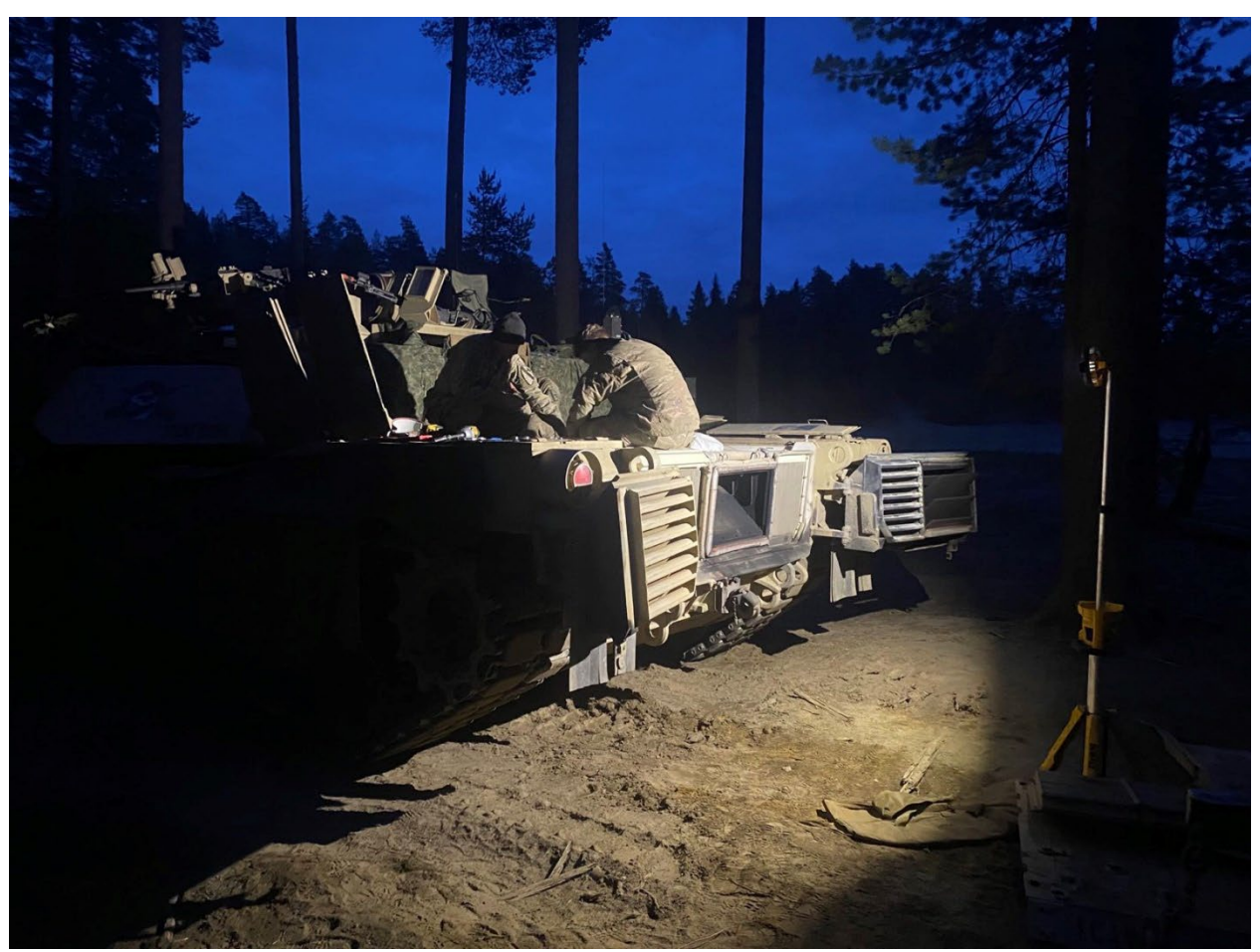
Figure 3. Mechanics from Assault Company, 1<sup>st</sup> Battalion, 8<sup>th</sup> Cavalry Regiment's field maintenance team conduct battle damage assessment repair on an M1A2 SEPv3 Abrams tank during Operation Lock, May 2023.

Overall, this reduction of one tank crew results in the new tank company MTOE of 16 NGMBT tanks per company, three platoons of five tanks and the company commander's tank. Bigger picture, this is an increase of four tanks for a combined-arms battalion, increasing from 29 M1 Abrams tanks to 33 NGMBTs. Furthermore, this new MTOE would require 10 less 19K series Soldiers to operate all 16 NGMBT when compared to the current MTOE to operate all 14 M1 Abrams. Jump crews can be established within the headquarters sections to mitigate negative effects from the personnel loses. These jump crews can be aligned with platoons during garrison operations to assist with maintenance. In a tactical environment, these jump crews can rotate on tanks during security-rest cycles allowing the tank company some flexibility in its fighter management during continuous combat operations. My overall recommendation is that a minimum of two jump crews, four 19K Soldiers, are considered for any changes to the MTOE associated with changes from the NGMBT's manning.